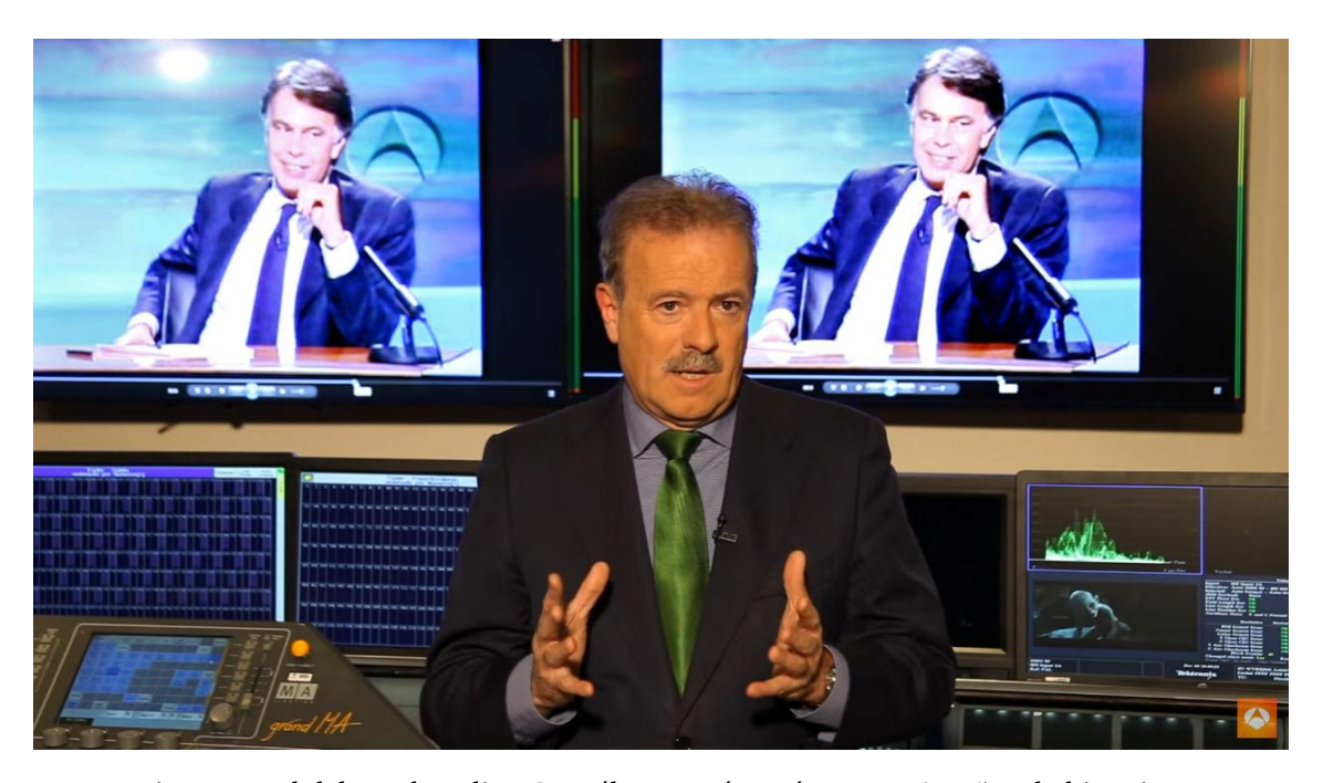
Figure 7. «El debate de Felipe González y José María Aznar: 25 años de historia».

A paradigmatic example of the institutional value of video footage is the face-to-face electoral debate between Spanish party leaders, Felipe González and José María Aznar, just prior to the Spanish general election in 1993 (Figure 7). In addition to its obvious historical value, this was the first televised debate of its kind in Spain, making it also valuable for the history of the media company itself. After all, footage illustrating an institution's major milestones is often used to highlight its authority or importance in its domain.