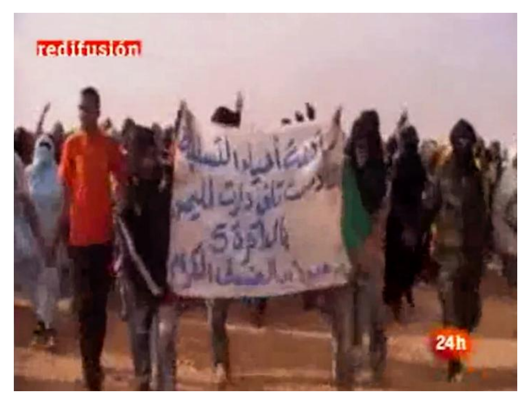
Figure 2. Footage used in the news story «La intifada saharaui».

A good example of the use of such information sources is provided by a weekly news program, Informe semanal (Weekly report) , on Televisión Española , Spain's national stateowned, public-service television broadcaster. Following the ban placed on the world's media by the Moroccan government in 2010 from entering the city of Laayoune to report on clashes, the news story La intifada saharaui (The Sahrawi Intifada) included videos uploaded to YouTube by activists of the Thawra association that denounced the plight of the Sahrawi people (Hidalgo & López, 2014) (Figure 2).