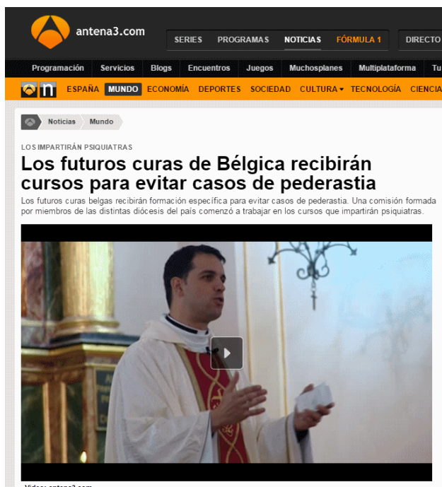
Figure 10. Shot of an identifiable priest, first used on a story about job satisfaction, later reused in a different story about pederasty.

A further illustrative example is shown in Figure 11. The picture next to the headline («New York's public internet faces two problems: beggars and porn») unfortunately has negative implications for the man portrayed in it: he may be assumed either to be a beggar or to be a consumer of pornography, or indeed both, when none of the situations might be correct. Attention should also be paid to the fact that choosing a black person in such a negative context is also perpetuating a racial stereotype.