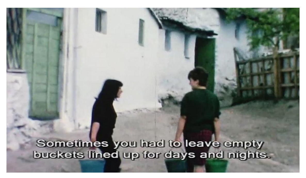
Figure 1. Archive footage used in the documentary Barraques: la ciutat oblidada .

Thorough documentary research is, therefore, vital if we want to ensure that images serve as a testimony to truth and not as a servant to untruth. In this regard, the FIAT/IFTA Archive Achievement Awards recognize the true worth of audiovisual research. An excellent example of such work is provided by Barraques: la ciutat oblidada (Shanties: the forgotten city) , a documentary produced by Televisió de Catalunya, the public broadcasting network of Catalonia, about the urban phenomenon of shanty dwellings in 20th-century Barcelona (Figure 1).