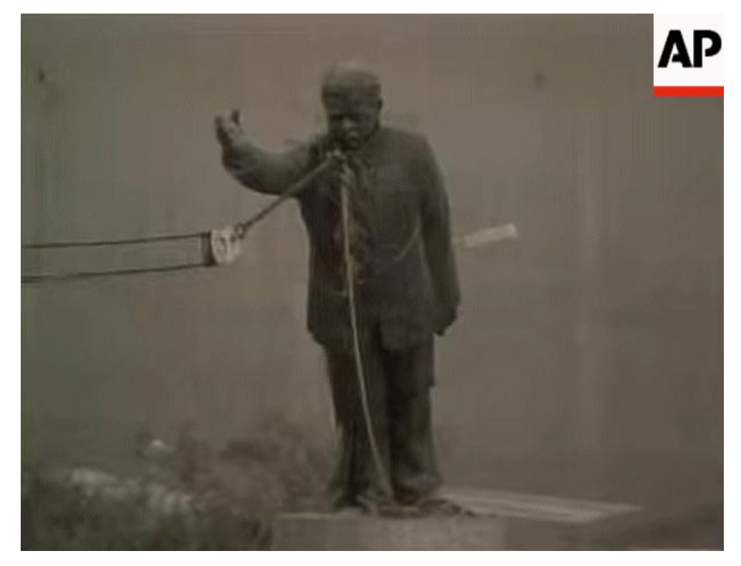
Figure 4. Broadcast of the destruction of the statue of Saddam Hussein.

of bronze. The scene broadcast live worldwide became an icon of the war, a symbol of final victory over Saddam Hussein» (Figure 4).