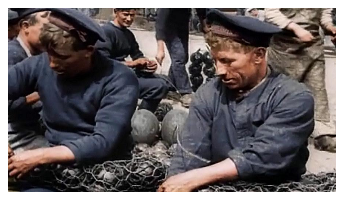
Figure 12. World War 1 in Colour (2003). Footage «recast in colour [...] to tell the story of the First World War as it was seen by those who fought it».

Preserving the original speed of the footage is also essential, given that altering the speed can affect the sound quality and the viewers' perception of the speakers. In January 2016, the Spanish news program Antena 3 Noticias allegedly manipulated the speed of a video clip of politician Anna Gabriel, making her voice sound shaky and insecure as she justified a trip to Venezuela with members of the political party Podemos (Figure 13). This distortion, whether intentional or not, was seen as an attempt to discredit her and sway public opinion. Therefore, changing the speed of archive footage can misrepresent the personalities depicted and may have ethical and political implications.