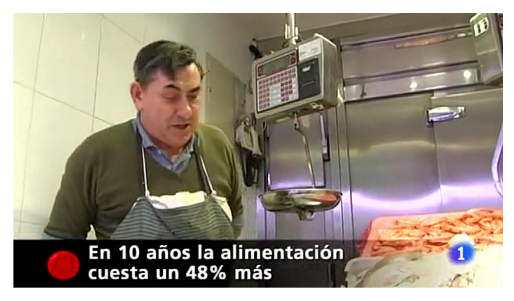
Figure 5. «Algunos las prefieren rubias».

among other events that have occurred during the euro era. Taken together, such footage offers interesting insights and enables us to chart the changing face of our society.