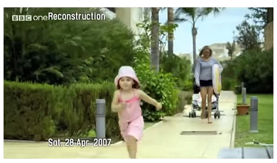
Figure 9. Reconstruction of the disappearance of Madeleine McCann.

Fictional footage or the reconstruction of events can be used in documentaries because of lack of actual footage or to visually enrich the production, but it should not be presented as actual footage. Instead, its origin must be clearly stated both on screen and in the archive database (Figure 9).