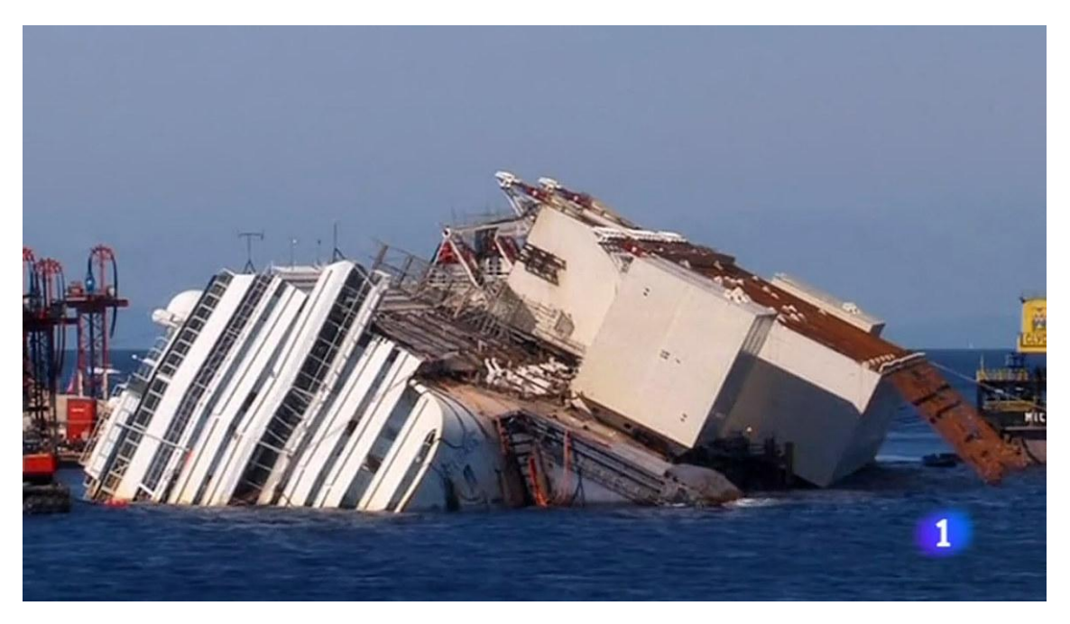
Figure 8. «Condenan a Schettino a 16 años de cárcel por el naufragio del Costa Concordia».

A good case in point is the coverage of the Costa Concordia disaster, which was not a simple one-off event, but rather the beginning of a recurring set of related events. After the cruise ship capsized and sank, the story regained international attention on two further occasions: first, twenty months after the disaster, when the refloating operation was begun; and, second, three years later, when the captain was sentenced. Every breaking story reused footage from previous pieces (Figure 8).