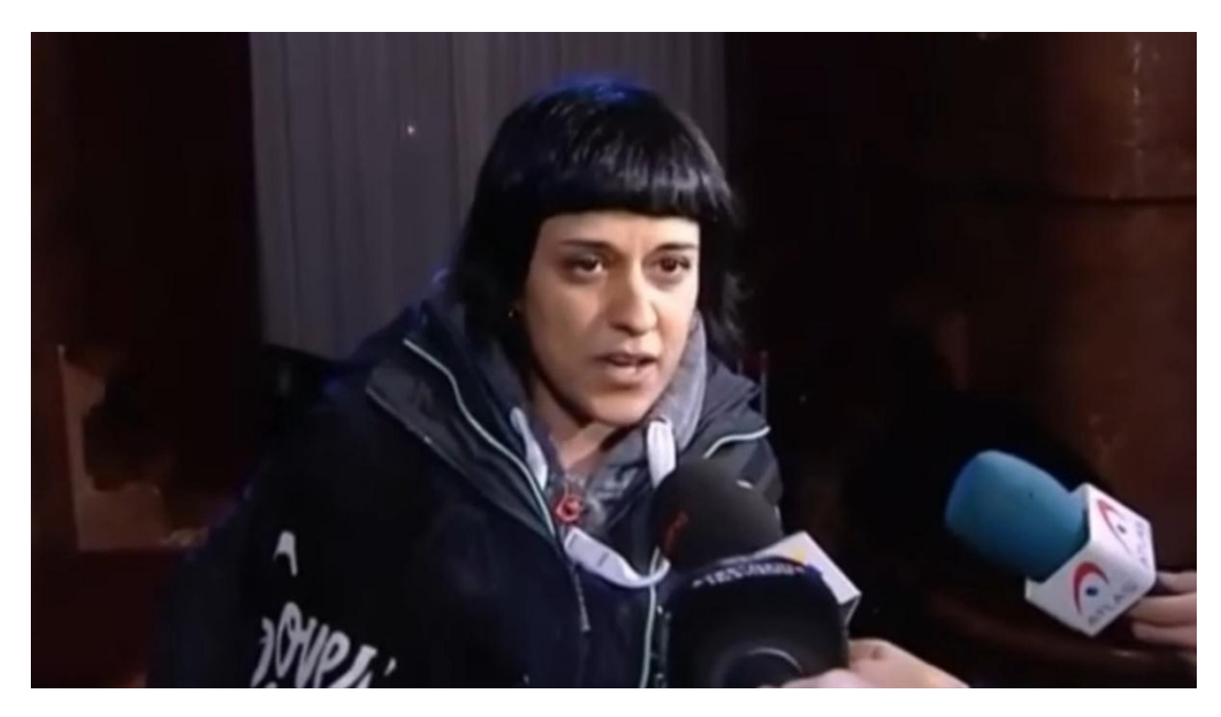
Figure 13. Anna Gabriel giving statements to several media outlets.

Preserving the original speed of the footage is also essential, given that altering the speed can affect the sound quality and the viewers' perception of the speakers. In January 2016, the Spanish news program Antena 3 Noticias allegedly manipulated the speed of a video clip of politician Anna Gabriel, making her voice sound shaky and insecure as she justified a trip to Venezuela with members of the political party Podemos (Figure 13). This distortion, whether intentional or not, was seen as an attempt to discredit her and sway public opinion. Therefore, changing the speed of archive footage can misrepresent the personalities depicted and may have ethical and political implications.