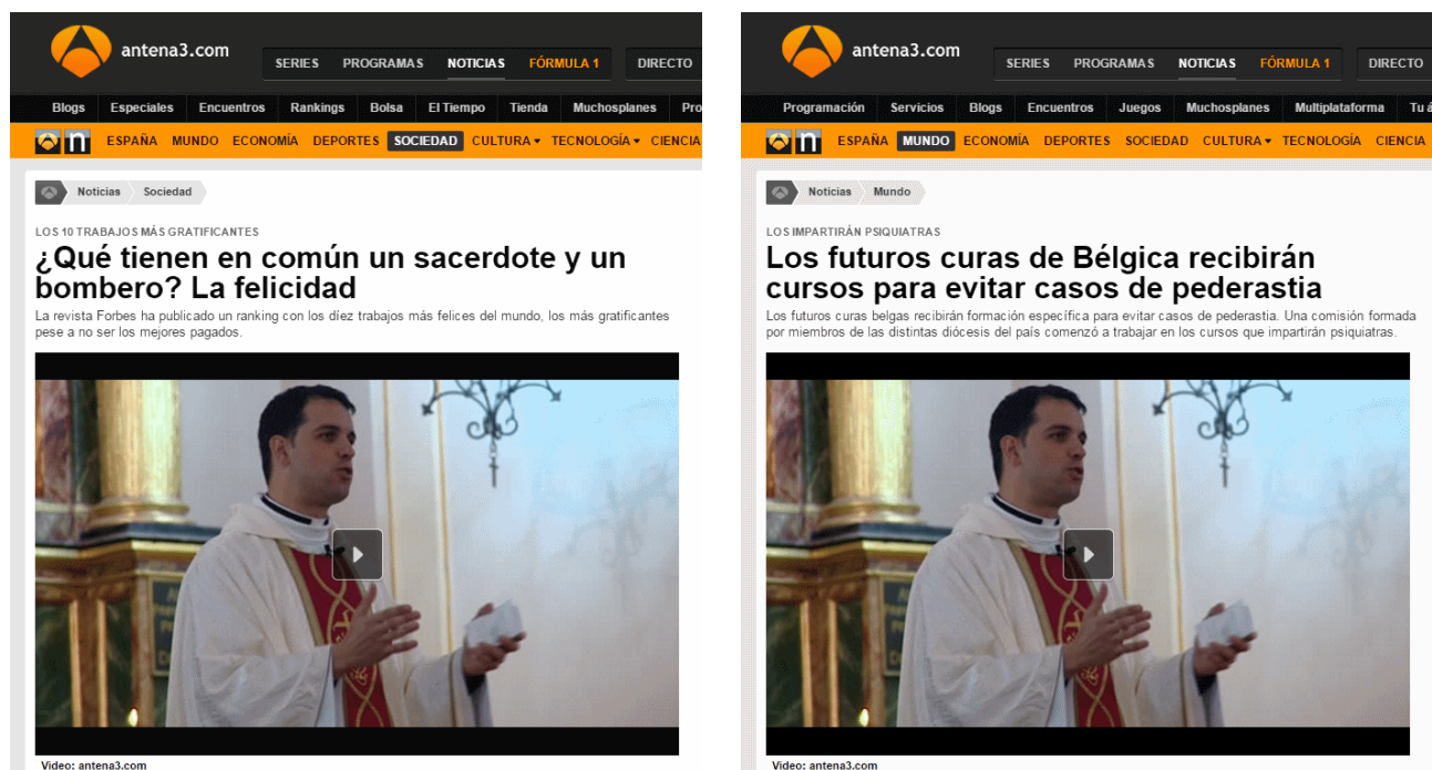
Figure 10. Shot of an identifiable priest, first used on a story about job satisfaction, later reused in a different story about pederasty.

Even if the material was originally recorded with the permission of the people featured, they can be offended by the reuse of these images if they are used to illustrate negative issues. For instance, footage of an identifiable person having a drink should not be used to illustrate the problem of rising rates of heavy drinking. Those affected, be they individuals or companies, can seek legal action against the broadcaster. An example of this kind of misuse is shown in Figure 10.